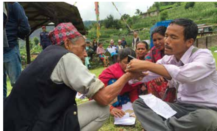
A villager at Thulopakhar VDC of Sindhupalchowk signing the housing grant agreement.