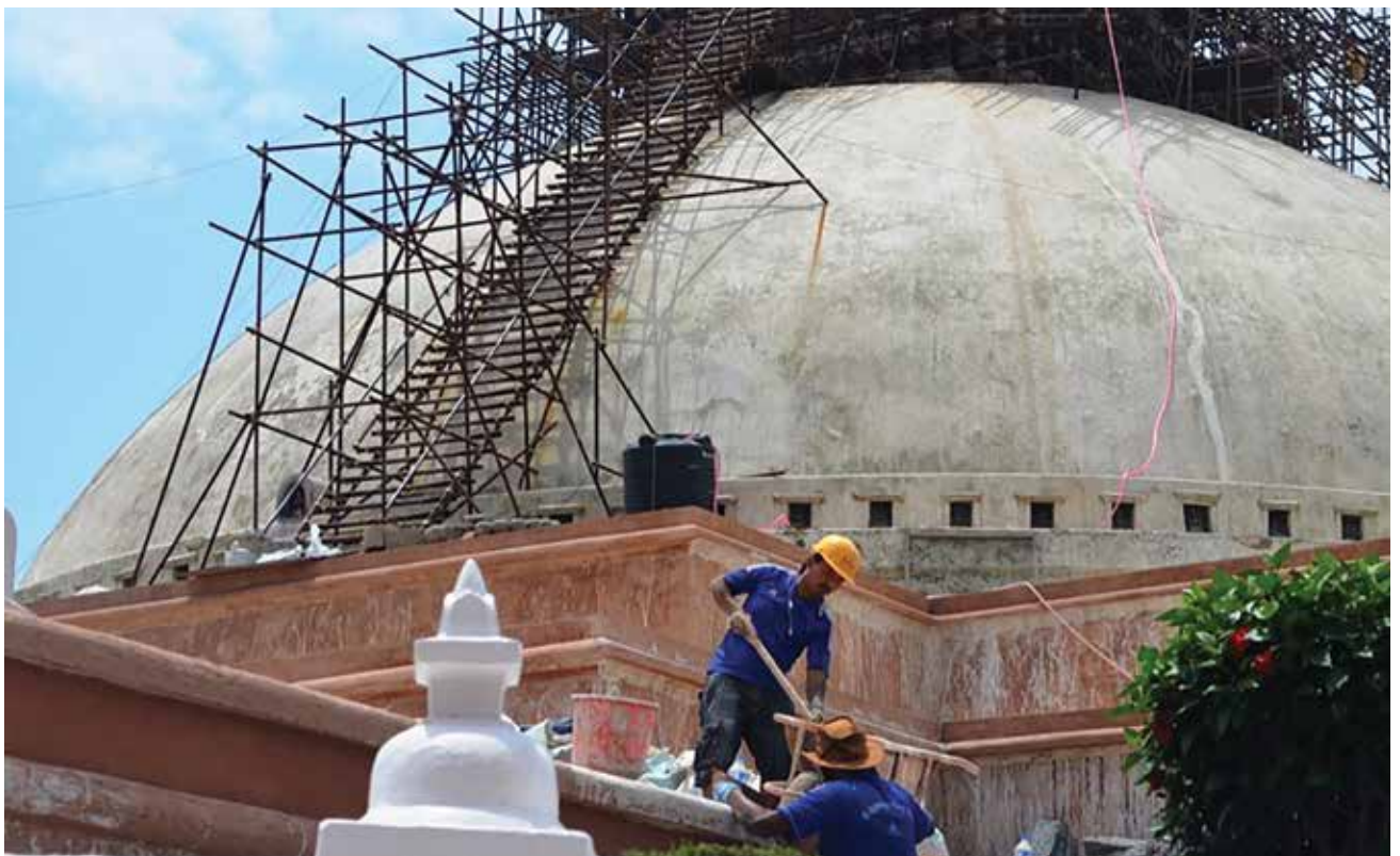
Reconstruction underway at the Boudhanath Stupa.

phase. The Basantapur Durbar Square area and the Nuwakot Durbar will be rebuilt with the support of the Government of China. Similarly, Kathmandu Valley Preservation Trust will rebuild Patan Durbar Square area and the Government of Germany will support the reconstruction of the heritage sites in the Bhaktapur Durbar area.