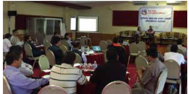
NRA and CLPIU staffs at a communication training organized by the NRA.

On 12 September the NRA had received more than 170,000 grievances from the 11 earthquake affected districts.