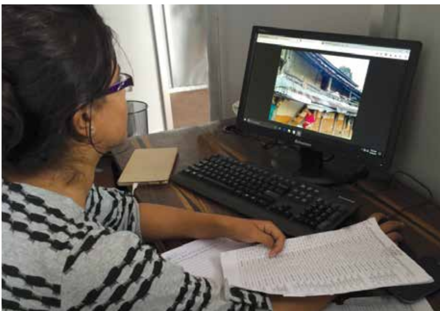
An engineer at the NRA reviewing grievances received from different districts.

The District Grievance Redressal Committee coordinated by Chief District Officer oversees grievances related to land ownership issues. Other grievances such as people missed in the survey, not listed on the beneficiary list, multiple ownership of house, and technical issues are handled at the central level.