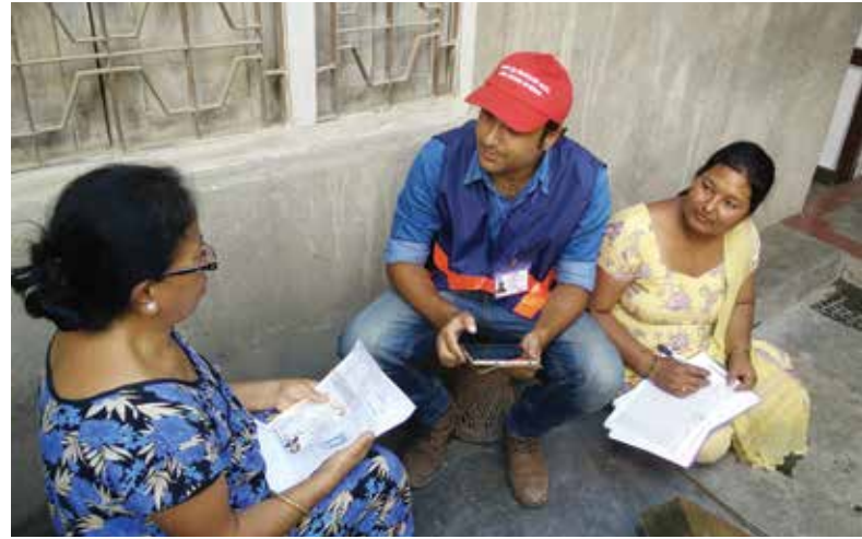
Engineer at a survey of an earthquake damaged house in discussion with a family in Kathmandu.

The Central Bureau of Statistics (CBS) has completed the survey of 115,848 houses that were damaged by the April 2015 earthquake in the three districts of Kathmandu Valley (Kathmandu, Bhaktapur and Lalitpur). In end-September the CBS had completed the survey of 53,149 households in Kathmandu District, 32,038 in Bhaktapur and 30,661 in Lalitpur. The NRA has begun preparing lists of households that would be eligible for housing grants.