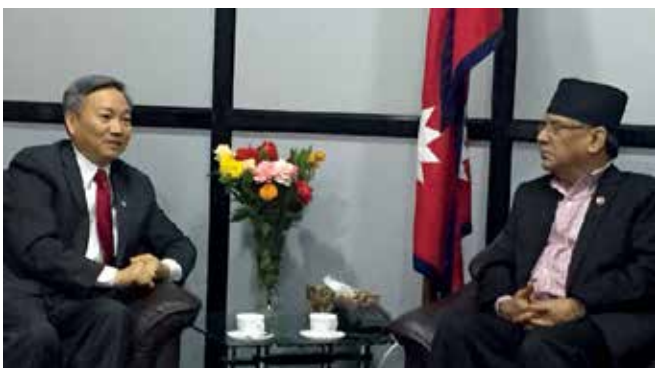
Prime Minister Pushpa Kamal Dahal with The World Bank Country Director for Nepal Qimiao Fan.

The World Bank has welcomed the progress made by the NRA in housing grant distribution. Qimiao Fan, Country Director to Nepal met Prime Minister Pushpa Kamal Dahal on 22 September and complemented the government and the NRA leadership for accelerating housing grants distribution.