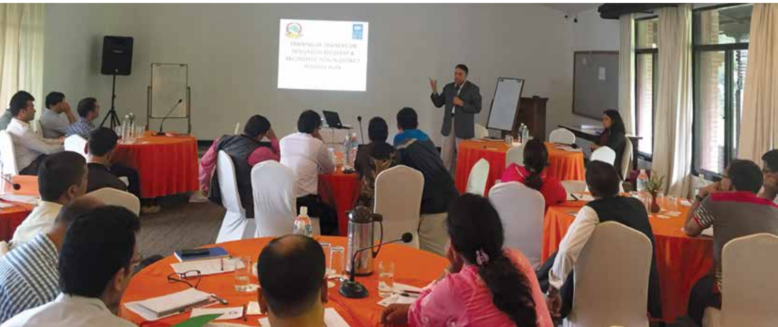
NRA CEO Suhil Gyewali at a training session on the localization of PDRF.

The training on the Guidance Note was expected to take the information on reconstruction priorities to the sub-national levels where the local level plans are prepared and implemented. It covers approaches for integrating recovery, reconstruction and disaster risk reduction in the district, municipality and VDC development plans.