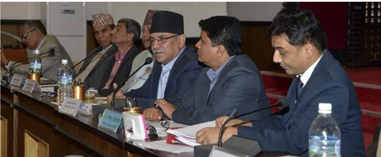
PM Pushpa Kamal Dahal addressing the Development Committee of Parliament on 5 September.