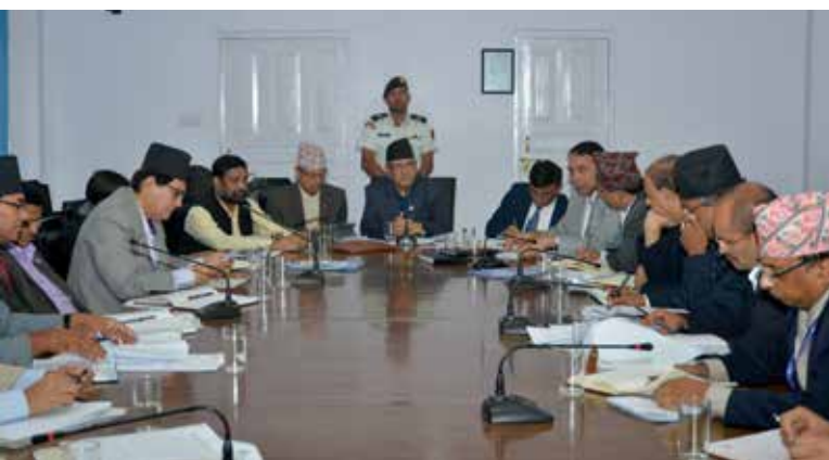
Prime Minister Pushpa Kamal Dahal at the Steering Committee meeting.